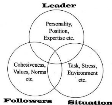
Fig. 9.1. A framework for analyzing leadership. Adapted from EP Hollander : Leadership Dynamics: Practical Guide to Effective Relationships

The leadership framework consists of three elements – leader, follower and the situation.