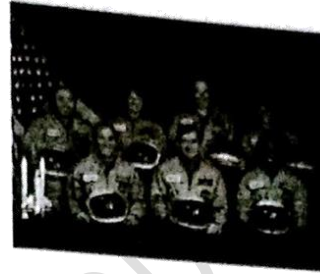
Fig. 8.3. The seven crew members

On 28th January, 1986 NASA launched its Challenger space shuttle STS-51-L from Kennedy Space Center, Florida carrying seven astronauts including schoolteacher Christa McAuliffe - the first civilian to set out on a space mission. Florida had been experiencing particularly cold weather, and during the night before the temperatures had dipped as low as -13^{\circ}\text{C} . The Challenger spacecraft consisted of a liquid-hydrogen powered orbiter designed to come back to earth, two solid-fuel booster rockets to help take the space shuttle into orbit and a fuel tank that could be discarded once empty.