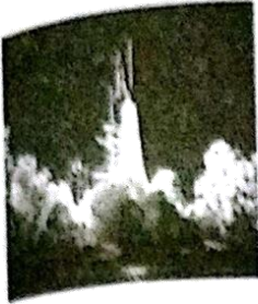
Fig. 8.1. The Challenger STS-51-L spacecraft at the moment of liftoff.